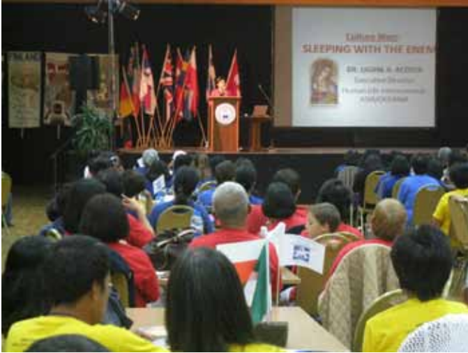
Some 800 participants from all over Europe came to the CFC-FFL Conference.