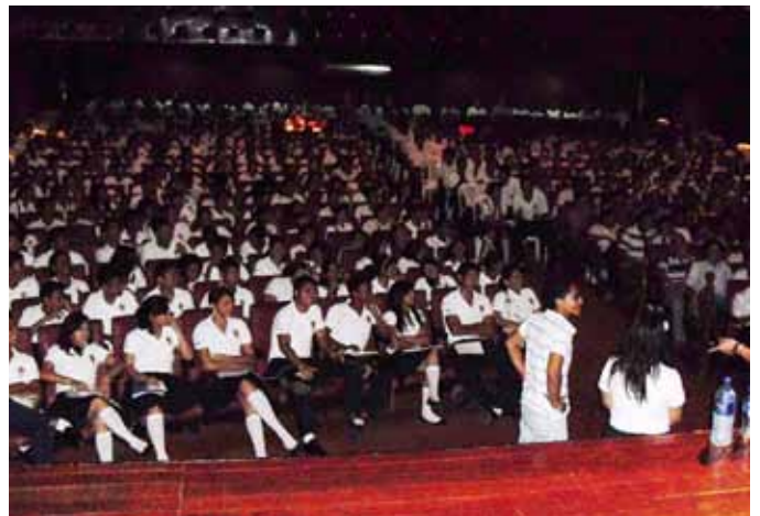
Partial view of lecture to High School and University students.