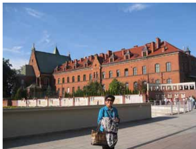
The convent where St. Faustina once lived in Krakow, Poland.