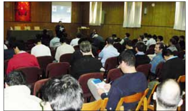
Lecture at the Faculty of Theology (above) and the Family Pastoral (below) in Uruguay.