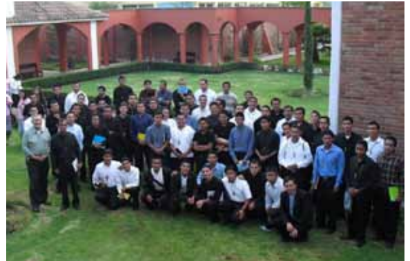
Above and below: Lecture at Seminary Misioneros Servidores de la Palabra en Morelia.

The visit to Mexico was gratifying because the lectures helped create more awareness about the right to life from the moment of conception to natural death and the willingness to establish strategies and alliances among