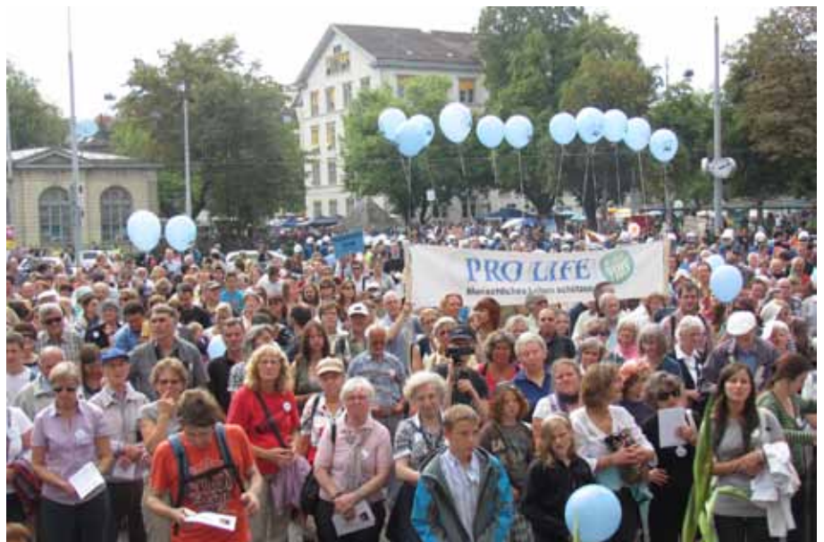
HLI-Switzerland's March for Life.

These rioters in no way deterred us. We all continued on our