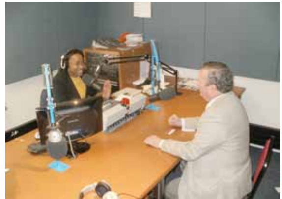
Interview at Radio Veritas, in Portuguese and English.

cannot afford to pay anything for them. Although the sale of my CD talks is essential to my family income, I could not say no. Radio Veritas is not a huge station, but it does reach out to many countries throughout Southern Africa, such as South Africa, Mozambique, Botswana, Swaziland, Lesotho, Zimbabwe, Namibia, Zambia, Malawi and Angola. So, after a vast promotional effort from September to November 2010, full broadcasting will begin in December, at the beginning of the new liturgical year. The HLI message and the truths of the Catholic Faith will thus be multiplied one hundredfold in southern Africa, and we may certainly count on Our Lord’s blessings for a fruitful outcome to this exciting venture.