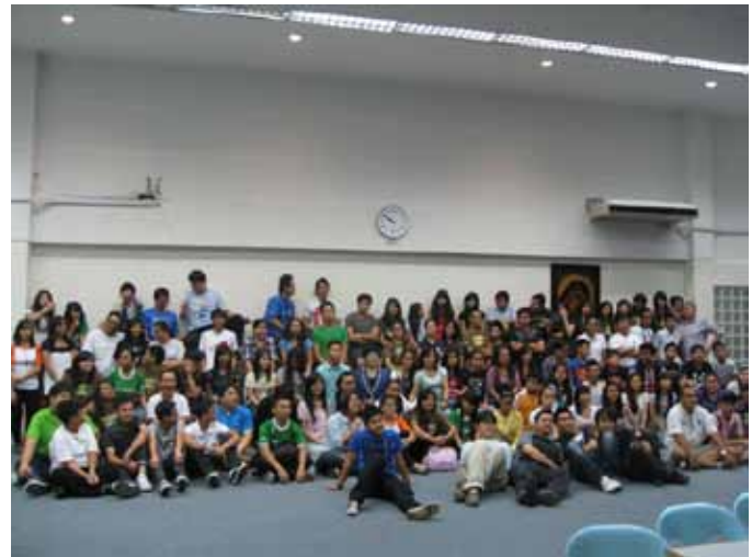
Participants at Ligaya’s session for the youth.