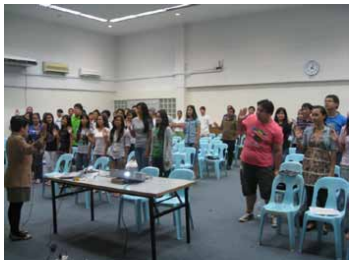
The youth of Kota Kinabalu, Malaysia, taking the vow of chastity.