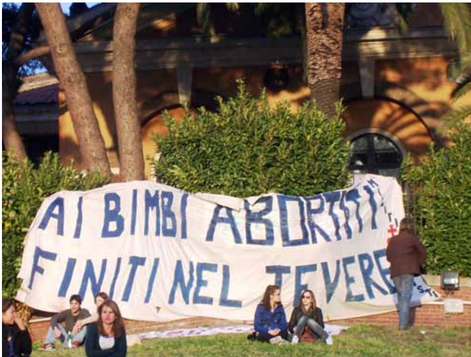
Pro-lifers in Rome display a banner to honor aborted babies dumped in the Tiber.