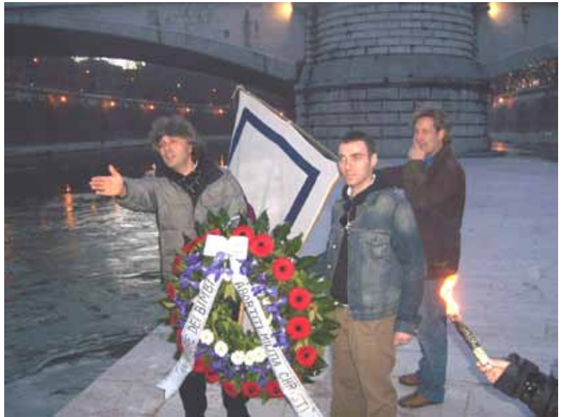
Innocent victims of abortion are honored with a wreath at the annual pro-life commemoration on the Tiber Island in Rome.

One of the great strengths of HLI is our expertise on the international pro-life situation. There are few places in the world where we do not have a presence, and every year we expand our outreach. This leads to frequent opportunities to spread the pro-life message on radio or television programs, as well as in the written press and on the Internet.