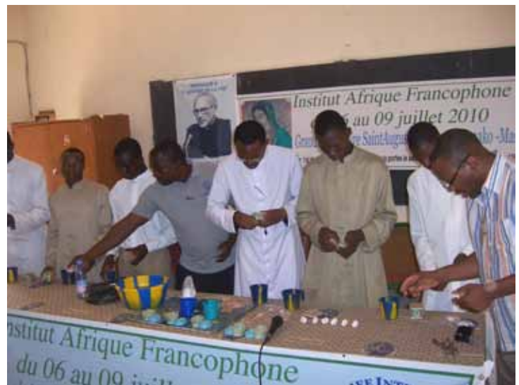
Seminarians learn about fetal model making.