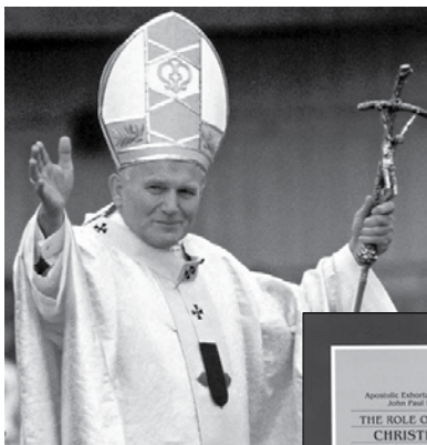
John Paul II outlines Catholic teaching on marriage and sexuality in his encyclical letter Familiaris Consortio .

It's never too late to turn our hearts back toward God. We are not powerless. We can make a difference by witnessing the truth about married love and fidelity to the culture around us. In December last year, in a pastoral letter entitled Good News of Great Joy , I spoke of the important vocation every Catholic has as an evangelizer. We are all missionaries. America in the 1990s, with its culture of disordered sexuality, broken marriages and fragmented families, urgently needs the Gospel. As Pope John Paul II writes in his apostolic exhortation On the Family (Familiaris Consortio) , married couples and