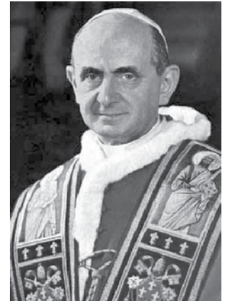
Pope Paul VI, author of the prophetic encyclical Humanae Vitae .

riage and sexuality. Many married couples, unaware of the valuable wisdom found in these materials, have deprived themselves of a beautiful source of support for their mutual love. I especially encourage couples to examine their own consciences regarding contraception, and I ask them to remember that “conscience” is much more than a matter of personal preference. It requires us to search out and understand Church teaching, and to honestly strive to conform our hearts to it. I urge them to seek sacramental Reconciliation for the times they may have fallen into contraception. Disordered sexuality is the dominant addiction of American society in these closing years of the century. It directly or indirectly impacts us all. As a result, for many, this teaching may be a hard message to accept. But do not lose heart . Each of us is a sinner. Each of us is loved by God. No matter how often we fail, God will deliver us if we repent and ask for the grace to do His will.