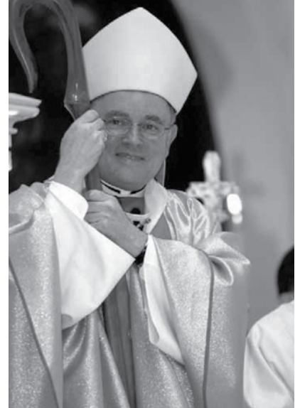
Most Rev. Charles J. Chaput, O.F.M. Cap.

First, he warned that the widespread use of contraception would lead to “conjugal infidelity and the general lowering of morality.” Exactly this has happened. Few would deny that the rates of abortion, divorce, family breakdown, wife and child abuse, venereal disease and out-of-wedlock births have all mas-