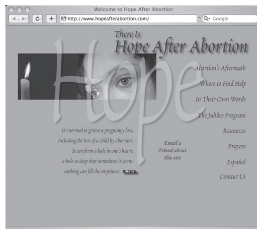
National Office of Post-Abortion Reconciliation & Healing can be found at http://www.hopeafterabortion.com .

It is critical for you as seminarians and future priests to understand the power of the Sacrament of Reconciliation to truly set people free and to lead them to the full truth. It is critical that you understand the power of the Eucharist to heal not just souls, but family systems. It is in the wisdom of God's mercy that He is changing the heart of the culture from the inside out. Every time someone is