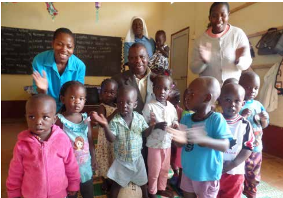
The Swati are culturally pro-life as can be testified by the way they love life and children.

Population control organizations from the West always begin with their wrong premise that a country’s growing population is the cause of poverty among people. Exaggerated statistics of high infant and maternal mortality rates are given as evidence. Accusations that illegal abortions are the main cause of high rates of deaths among women are not uncommon. And as usual,