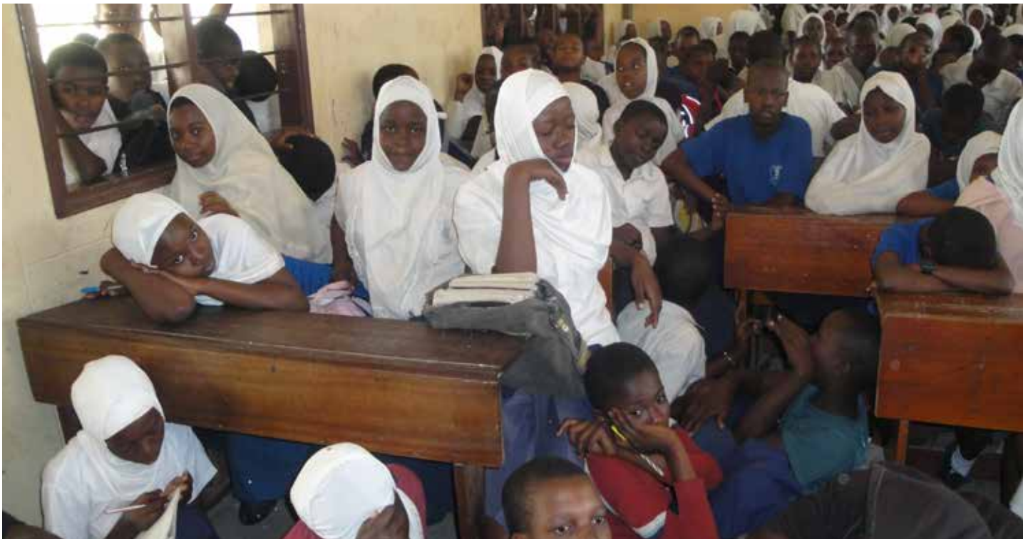
Population Services International continues to campaign for population reduction through contraception and abortion even though a number of Swazi are facing starvation due to famine.