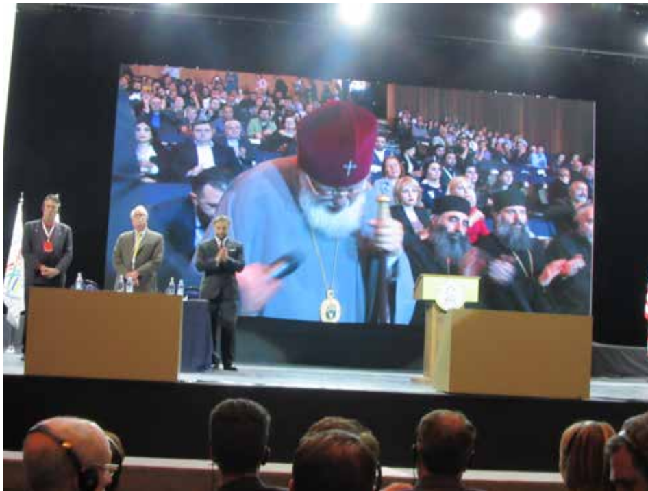
His Holiness and Beatitude Ilia II, Catholicos Patriarch of all Georgia (Orthodox Church), giving the Blessings and Keynote Address at the WCF X opening ceremony.