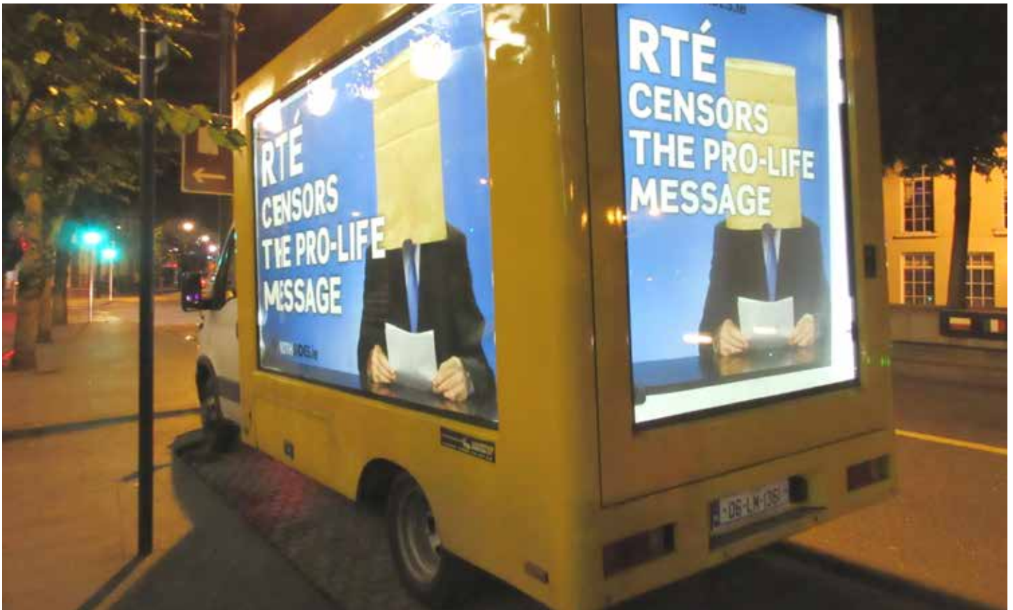
The media in Ireland are very anti-Catholic, and they especially hate pro-lifers. So an Irish pro-lifer made this illuminated van with large posters on three sides that proclaim "RTÉ CENSORS THE PRO-LIFE MESSAGE." (RTE stands for Radio Telefís Éireann, or Radio Television Ireland). Here is it parked outside the Tower Hotel in Waterford, where we had the third of our five major stops.