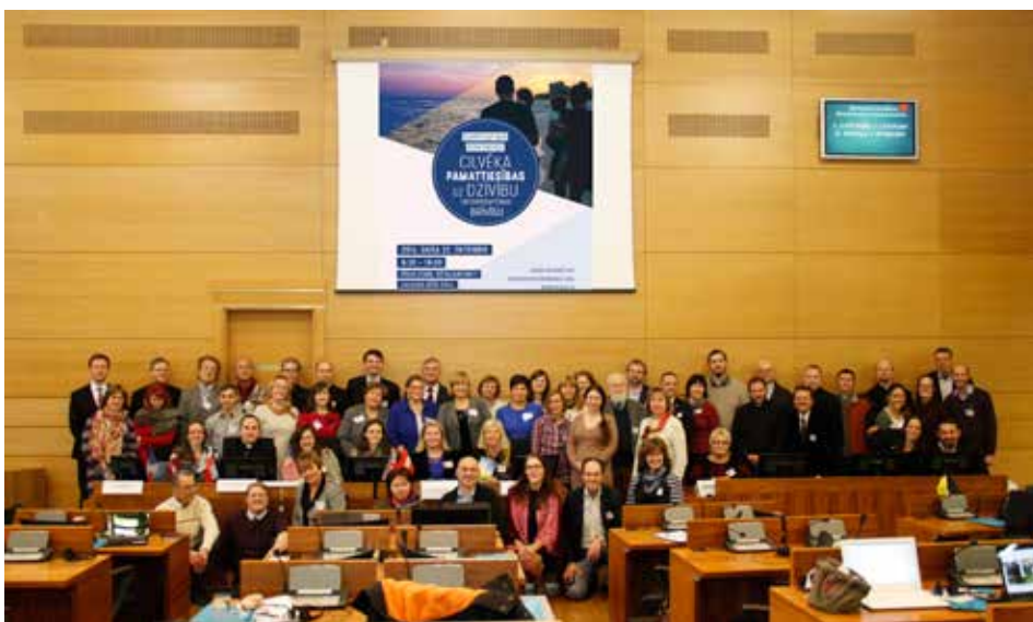
HLI's International Congress on "The Right to Life and Freedom of Conscience," organized in collaboration with 40 Days for Life.

The HLI congress took place in the grand chamber of the city of Riga and a live broadcast was streamed on the Riga City Council website. It was a great pleasure to have many European HLI leaders present and