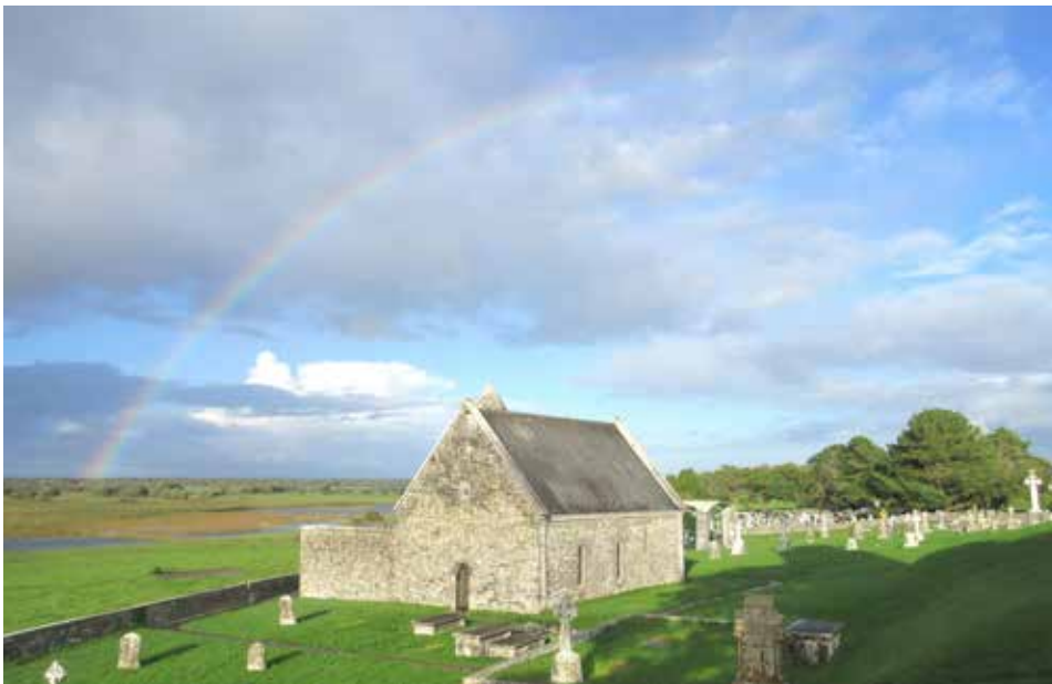
A rainbow over Connor Chapel (c. 1200), at the ancient Clonmacnoise Monastery in County Offaly, with the River Shannon in the background.

Then we all walked to the adjacent building to have a very enjoyable family evening of music, singing, and testimonies. Small children happily played and ran around the large room as children always do, and I could not help but be uplifted by their innocence and joy. We concluded our busy day with