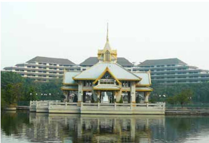
The 2017 ASPAC will be held at Baan Phu Waan, the Archdiocese of Bangkok's Pastoral Training Center.

As usual the 21 st ASPAC promises three full days of intellectual, social, and spiritual nourishment in the company of like-minded people from all over the world, with distinguished international and local speakers. Formerly held yearly, the ASPAC is now held every two years. (The 19 th ASPAC was held in Kota