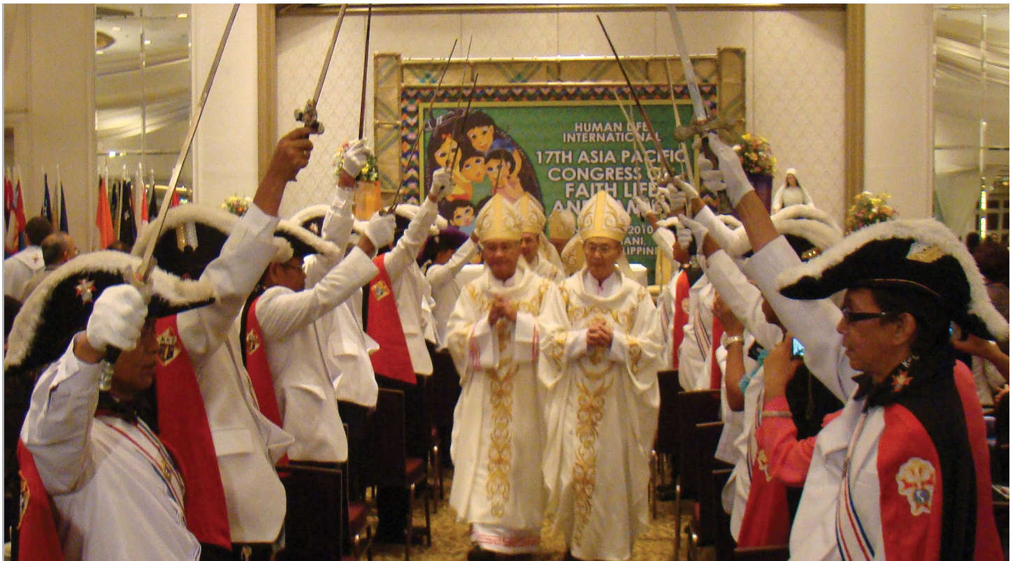
Entrance of bishops at HLI's 17th ASPAC in the Philippines.

Cebu, Philippines (1991 and 2001) Bangalore, India (1994 and 2004) Manila, Philippines (1995, 1996, and 2010) Singapore (1997 and 2003) Taegu, South Korea (1998) Mumbai, India (2000) Hong Kong, China (2002) Bali, Indonesia (2005) Bangkok, Thailand (2007 and 2017) Goa, India (2008) Miri, Malaysia (2009) Astana, Kazakhstan (2011) Kota Kinabalu, Malaysia (2013) Taiwan (2015) Bangkok, Thailand (2017) The 22 nd Asia-Pacific Congress on Faith, Life, and Family will take place in Kerala, India.