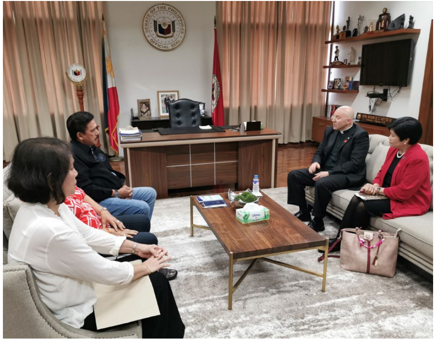
Meeting with Vicente Sotto, Senate President of the Philippines.