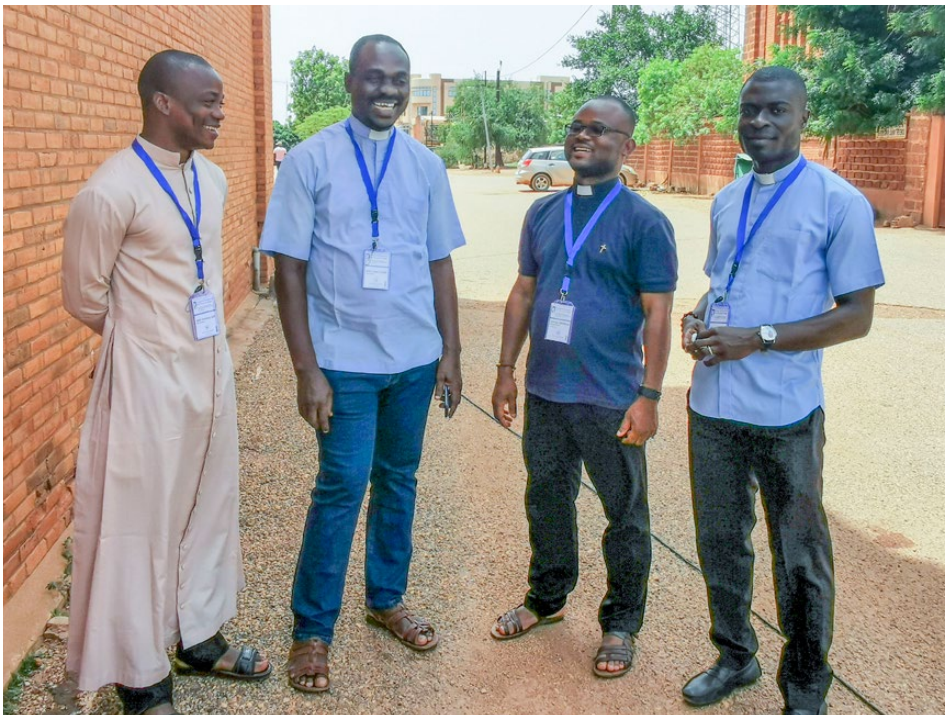
The smiles of these priests show the joyful love of God that they take into their parishes.