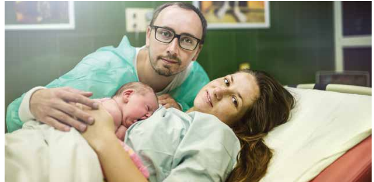
Progress in medical science in the last few decades, not the widespread practice of legal abortion, has produced declines in maternal deaths.

have probably decreased in the United States thanks to better technology and training, maternal deaths due to other abortion-related causes have increased dramatically. At least three major studies have shown that the most common cause of fatalities among pregnant women is murder, and statistics show that almost one third of these are due to men who kill their wives or girlfriends because they refuse to get an abortion. This amounts to 30 to 50 murders per year. 6