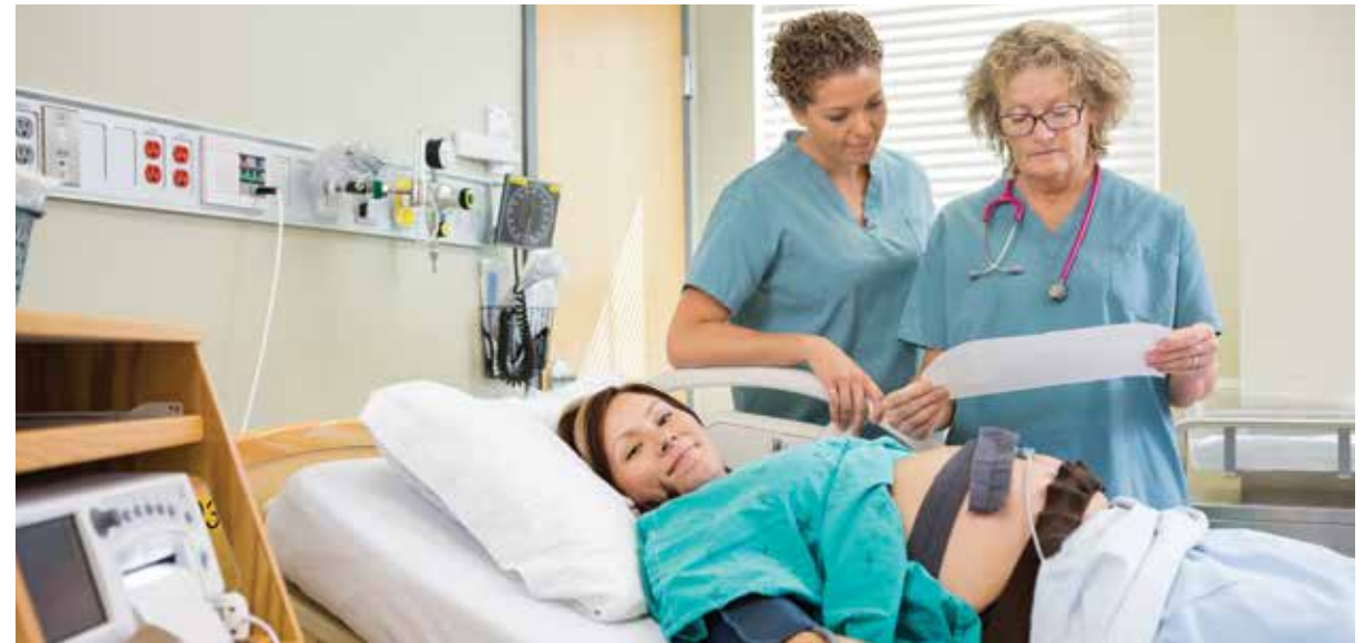
Because of advances in medicine, there are currently no maternal medical conditions for which abortion is the only cure.

for almost any patient to be brought through pregnancy alive, unless she suffers from a fatal disease such as cancer or leukemia, and if so, abortion would be unlikely to prolong, much less save the life.” 2 Former Surgeon General of the United States Dr. C. Everett Koop said that “the lifeofthemoth argument surfaces in every debate concerning abortion. The fact of the matter is that abortion as a necessity to save the life of the mother is so rare as to be nonexistent.” 3