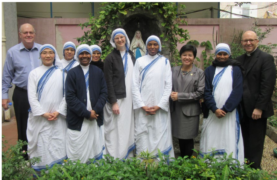
The Sisters of the Missionaries of Charity.

Our next destination was the convent of the Missionaries of Charity,