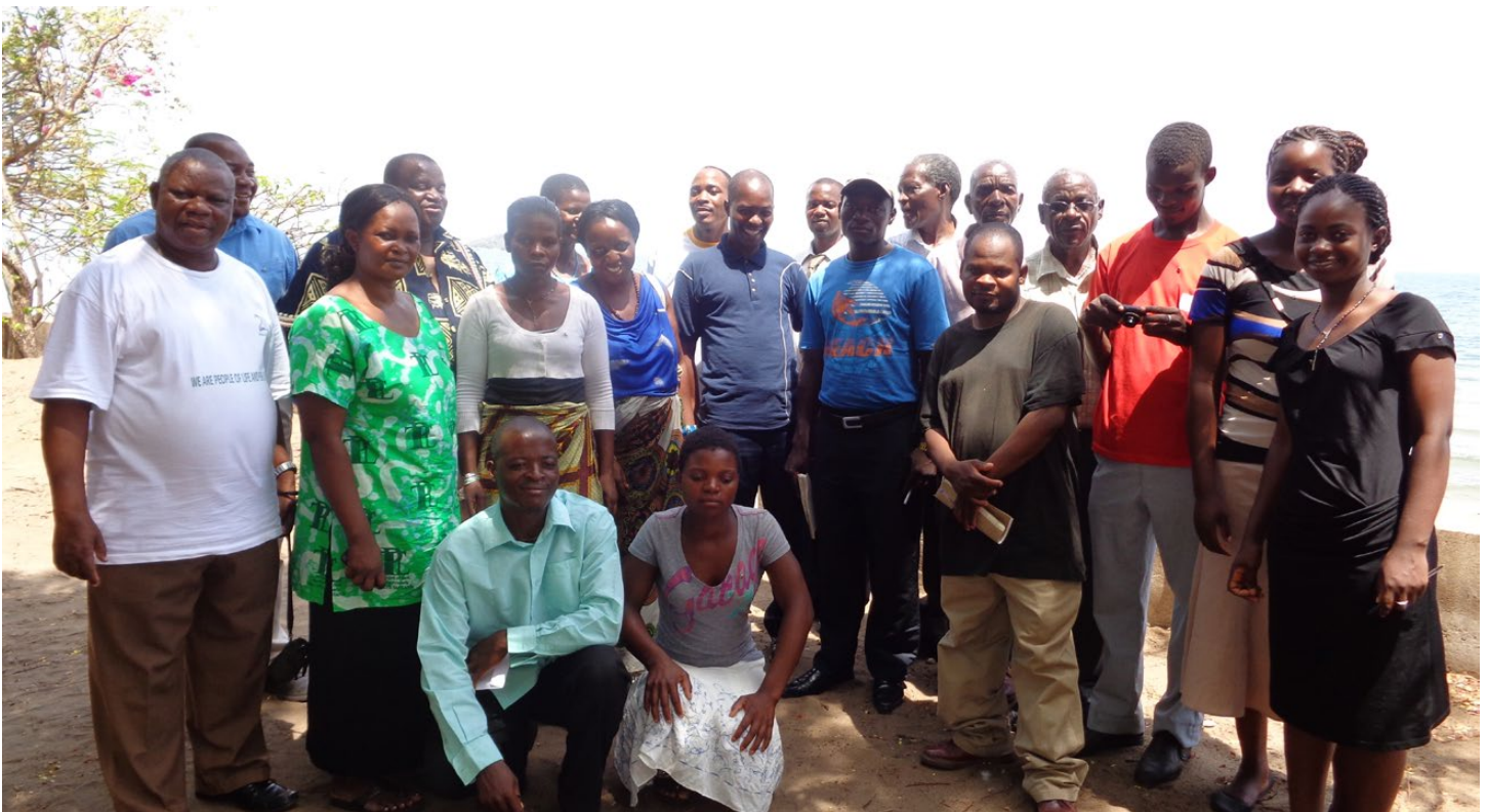
Malawi pro-lifers after the conference.

The Sunday before I left, I attended Holy Mass at the Poor Clares Convent in Lilongwe. I used the occasion to pray for Malawi’s pro-life movement. The liturgy was superb, especially the singing. One would be tempted to think that a host of angels had joined us in that liturgical worship. Watching the sisters pray, I was convinced they were praying for their country, which is being devastated by the Culture of Death. I joined them to pray for the people of Malawi so that the all-loving God would give them strength against the blowing wind of the Culture of Death. I asked God to bless Pro-Life Malawi and guide it through this period of darkness in Africa. Please join in these prayers for the pro-life movement in Malawi.