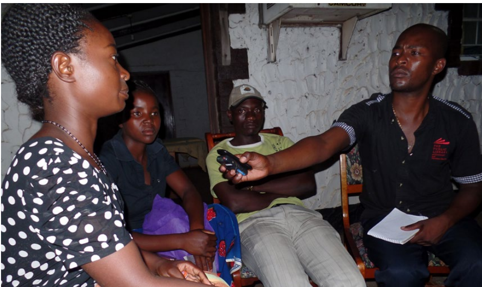
Radio Maria journalist interviews participants at Malawi conference.

HLI's pro-life training conference took place at Sadiki Government Training Center located on the shores of Lake Malawi. In attendance were participants from the Catholic dioceses of Lilongwe and Dedza. The training period was limited, so the timetable was very tight. Each day began after morning prayers and Eucharistic celebration, after which we covered many issues over our three days together. The topics covered include: the essence of prayer in the pro-life ministry; the sacredness of human life; the science of fetal development; marriage and the family and natural family planning;