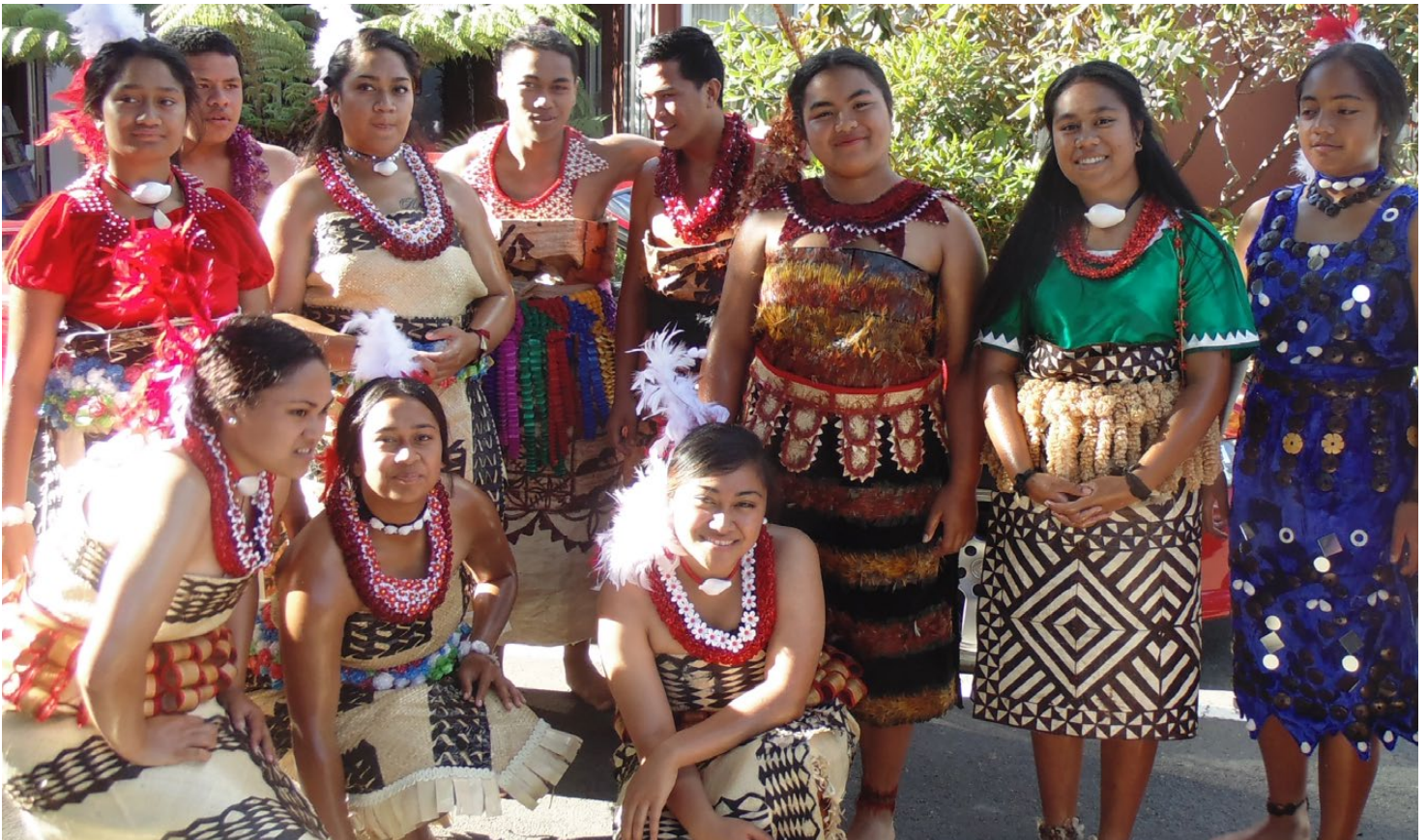
Tongan youth at the Wellington Eucharistic Convention.

tion I gave at the Wellington Eucharistic Conference) and the next night was on the 12 promises of the Sacred Heart of Jesus in the context of the Gospel of Life.