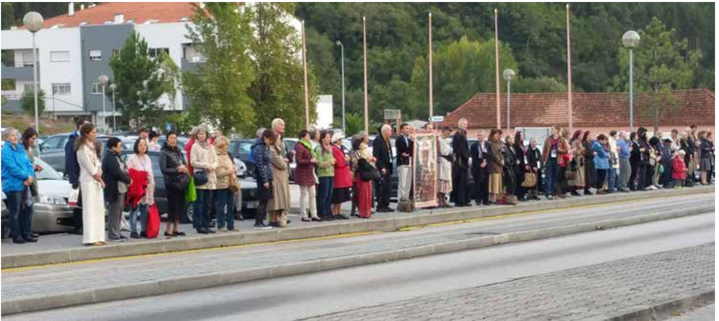
Participants of the Prayer Congress for Life pray the rosary across from a hospital where abortions are performed.