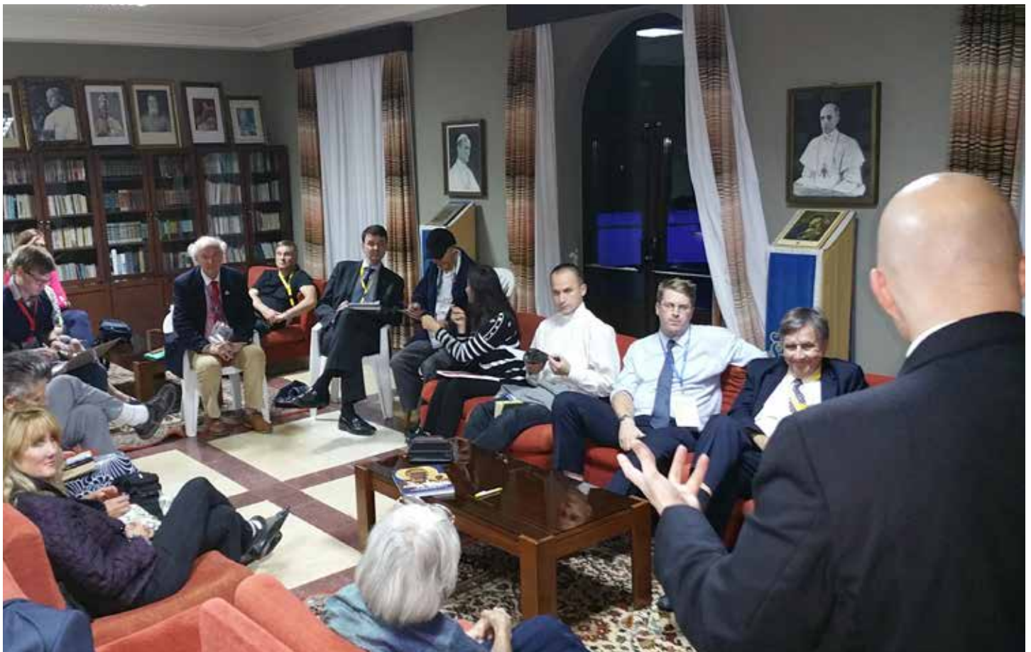
HLI affiliates from both Western and Eastern Europe meet to to discuss strategy and initiatives across the continent.

HLI took advantage of this gathering to bring in leaders from our affiliates of both Western and Eastern Europe. A delegation of Belarussians from HLI's affiliate actually drove all the way across Europe in a van! Fr.