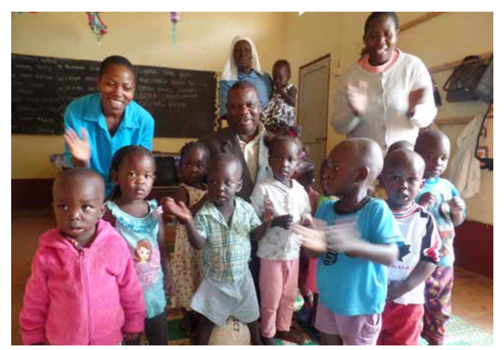
The Swati are culturally pro-life as can be testified by the way they love life and children.

Population control organizations from the West always begin with their wrong premise that a country's growing population is the cause of poverty among people. Exaggerated statistics of high infant and maternal mortality rates are given as evidence. Accusations that illegal abortions are the main cause of high rates of deaths among women are not uncommon. And as usual,