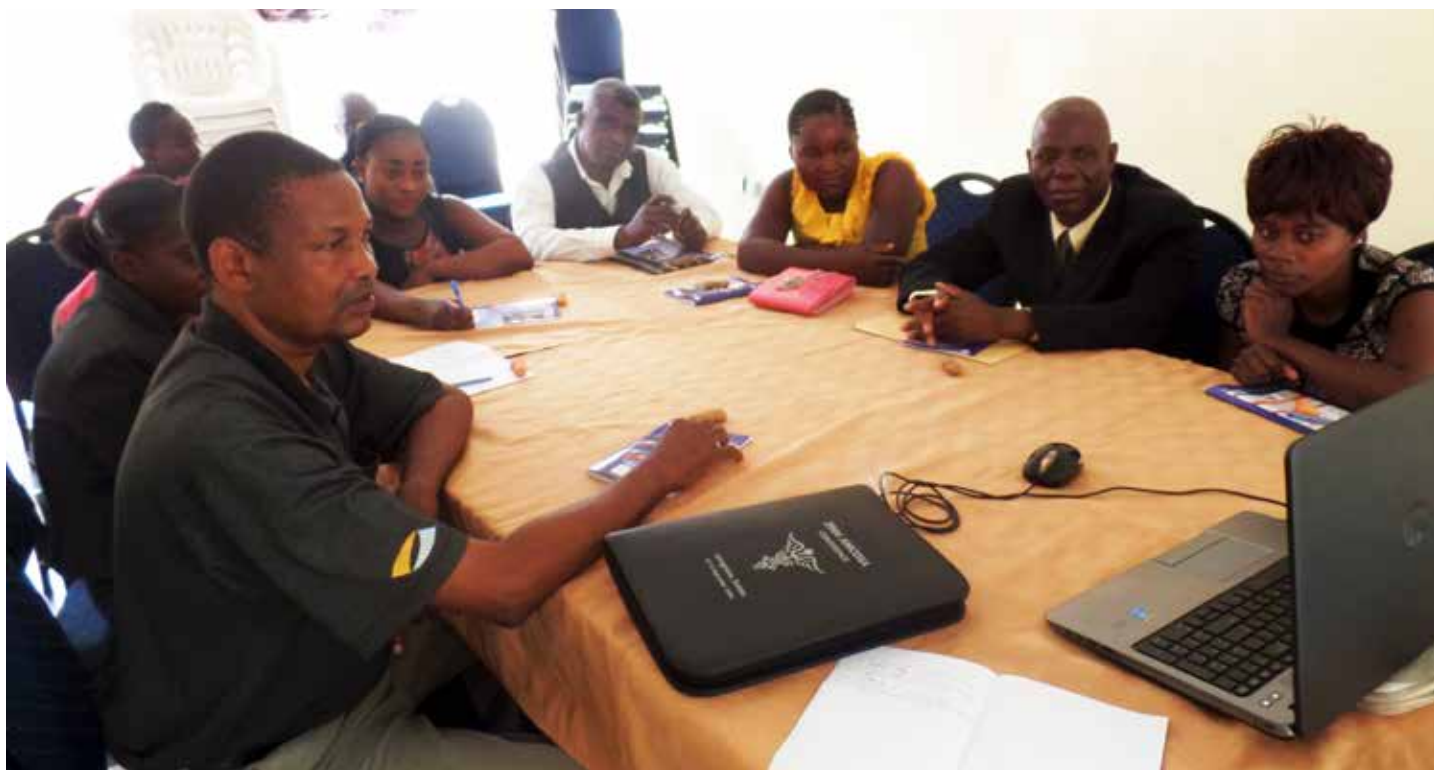
Trainees watching a video on abortion during HLI's pro-life training in Kitwe, Zambia.

On the third day and in the morning of the fourth day, I gave talks on the Culture of Death, revealing to the trainees the philoso-