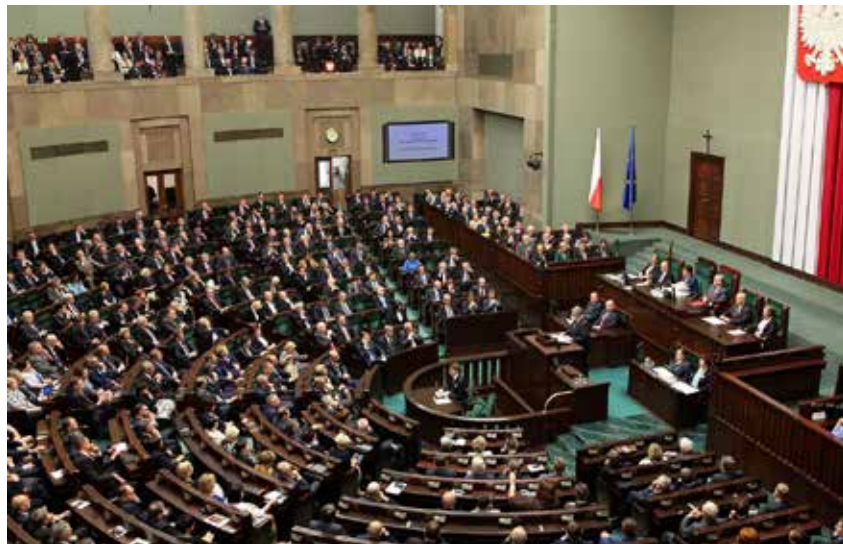
Members of Parliament voted 267 – 154 to send the “Stop Abortion” proposal to commissions.

In 1993, Poland became the only developed nation to go from completely unrestricted legal abortion to having very strong abortion restrictions in place. It is estimated that fewer