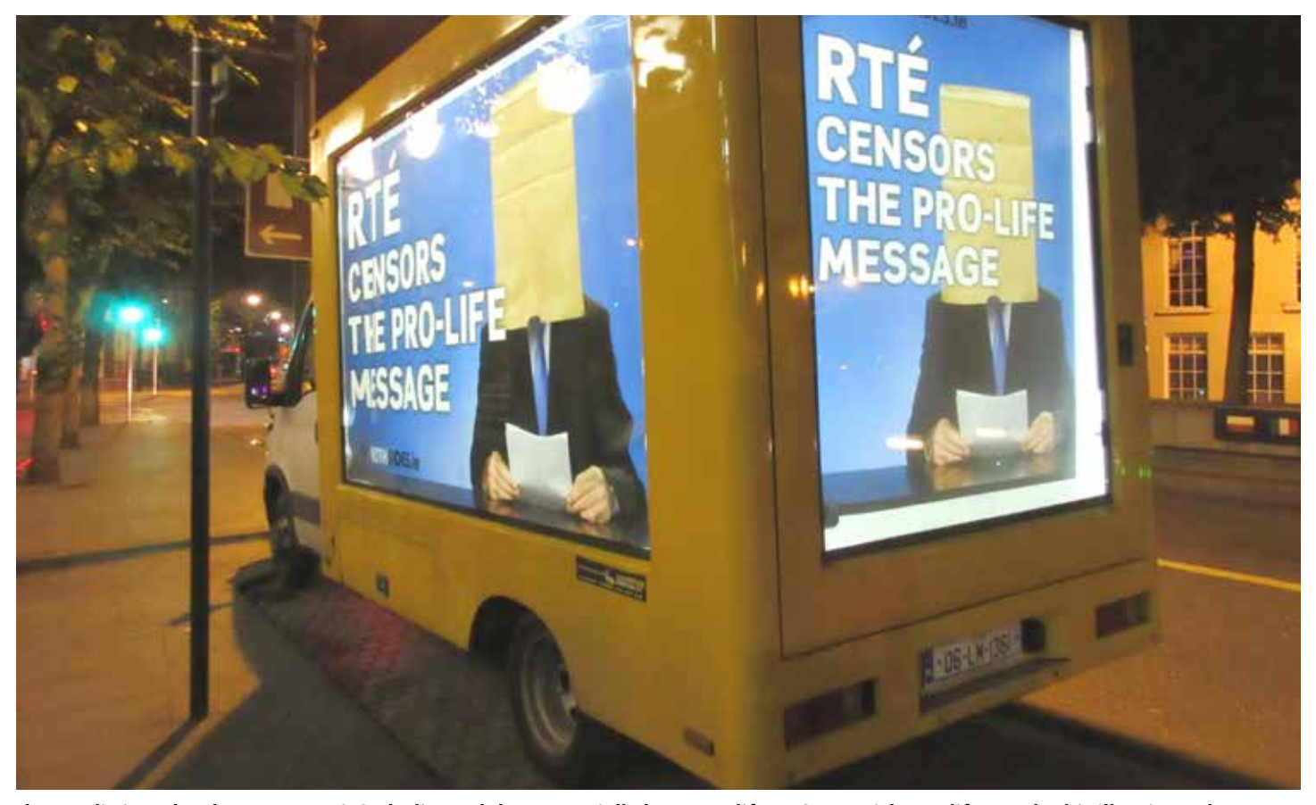
The media in Ireland are very anti-Catholic, and they especially hate pro-lifers. So an Irish pro-lifer made this illuminated van with large posters on three sides that proclaim "RTÉ CENSORS THE PRO-LIFE MESSAGE." (RTE stands for Radio Telefís Éireann, or Radio Television Ireland). Here is it parked outside the Tower Hotel in Waterford, where we had the third of our five major stops.