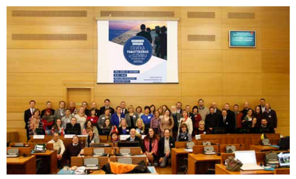
HLI's International Congress on "The Right to Life and Freedom of Conscience," organized in collaboration with 40 Days for Life.

My happiest discovery visiting Lithuania and Latvia for the first time was seeing the piety and fervor among Catholics. The crushing Soviet persecution of the Church ultimately strengthened her. It brought to mind an exchange I had heard at the 2011 HLI Asia Pacific Congress in Astana, Kazakhstan. "Who planted the Catholic Church in Kazakhstan? Joseph Stalin..." He exiled so many hundreds of thousands of Catholics from Lithuania, Latvia, Poland, Volga Germans, etc. to Siberia and the east that he created a Catholic presence where none had existed before. I experienced the dynamic and strong Church that exists today in this former Soviet Republic.