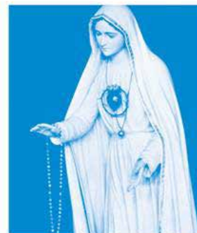
OUR LADY OF FATIMA'S PEACE PLAN FROM HEAVEN

Please send your gift of $53 or more to HLI this month, and let us rush this wonderful booklet out to you!