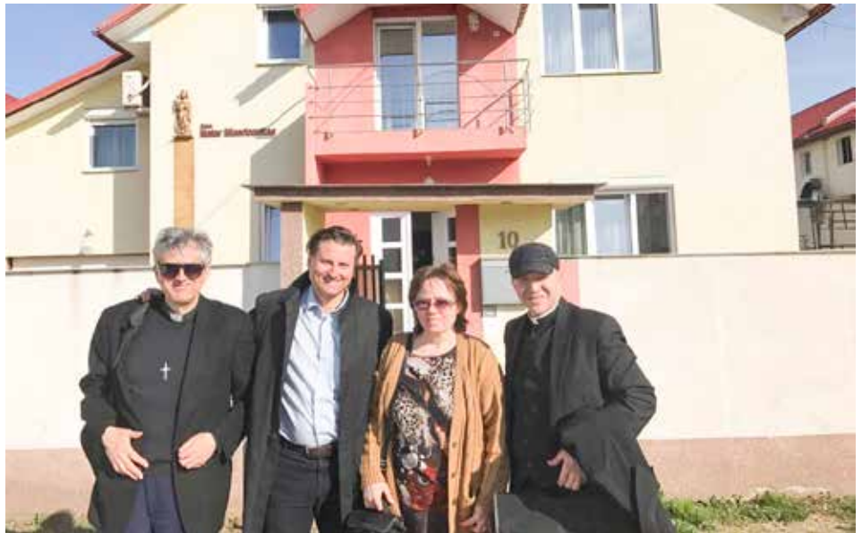
(Above) Sponsored by HLI through your generous support, Romania's "Mater Misericordiae" gives help to pregnant women in need.

Please continue to pray for the success of this most important work and that we are able to obtain the resources necessary to further these pro-life activities, which are so desperately needed. We still need your support in this selfless work intended to glorify God here in Eastern Europe. We travelled over 2,000 miles in this mission trip alone, a step in the journey of Life for all, from conception to natural death.