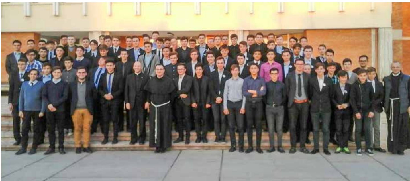
Your gifts have made pro-life training for seminarian formation possible in Romania (above) and in so many other parts of the world.

believe they are very religious, and about 90% affirm their belief in Jesus Christ, and yet they continue to have so many abortions! Thanks in part to your prayers and assistance, the “Gift of Life” Association, our HLI Affiliate in Romania, exists to counteract this. This organization creates short- and long-term diocesan counseling to pregnant women, and they have experienced incredible success.