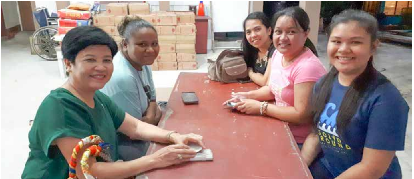
Youth Leaders in Palau enthusiastically received the news of HLI's mission work, resolving to embrace it personally and spread it far and wide in their country.

heading the El Shaddai Catholic Charismatic group. I've had associations with the group in the Philippines, where it was founded and is primarily based. Right then they invited me to speak on HLI at their next Sunday gathering after Mass. HLI's coming was God-sent, they said, as they had actually been praying for a speaker, hard to manage because of the cost.