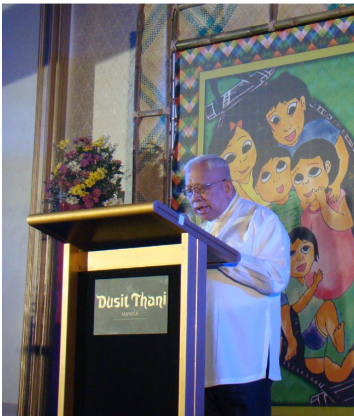
His Eminence Ricardo Cardinal Vidal of the Philippines delivering his Keynote Speech at HLI's 17th Asia-Pacific Congress on Faith, Life and Family.