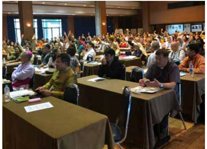
350 delegates gather for the 21st Asia-Pacific Congress.

It was lovely to see hundreds of delegates from almost two dozen nations harmoniously share a common pro-life vision. It was hard to keep to schedule as leaders had so many questions and enjoyed talking and