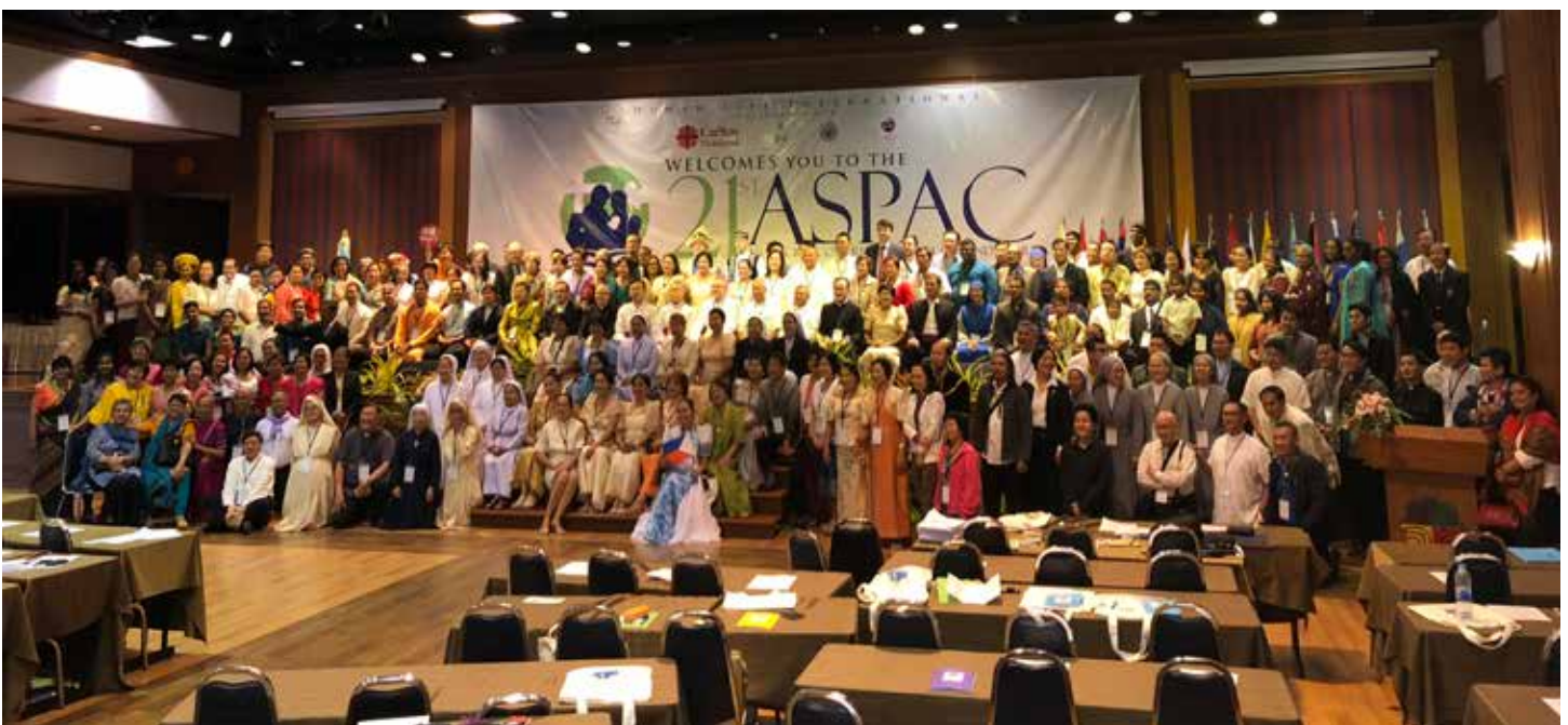
350 participants at the 21st Asia-Pacific Congress on Faith, Life and Family at the Baan Phu Waan Pastoral Center, Bangkok, Thailand.