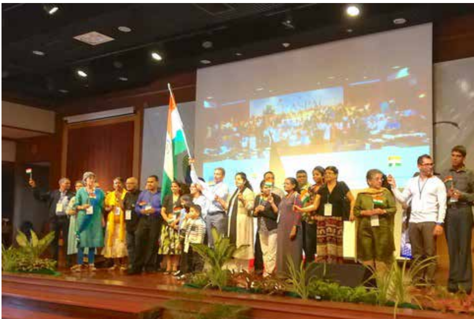
HLI 21st ASPAC participants from India

Thus, in the midst of all the sleepless nights and overflowing days of work pre-ASPAC, I wanted to be in my home office in Tacloban City, Philippines, to focus. However, I had committed to fly to Manila twice during the month, to fulfill the engagements in which I was the featured lone speaker. All in all, I gave 4 talks in different locations, before over 700 persons. Topics ranged from “The Threat of Ideological Colonization” to “Contraception: Why Not?” I was informed right before the last one that many in the audience are young couples practicing contraception, and told