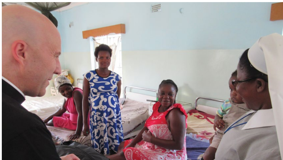
Marumbi Mission Hospital maternity ward. Women in their 8th month of pregnancy walk miles through the bush to wait a month to give birth.

"The U.S. economy will require large and increasing amounts of minerals, especially from less developed countries. This gives the U.S. enhanced interest in the political, economic, and social stability of the supplying countries. Wherever a lessening of population through reduced birth rates can increase the prospects for such stability, population policy becomes relevant to resource supplies and to the economic interests of the United States." What once was accomplished by weapons of war is now accomplished by NGOs and private entities.