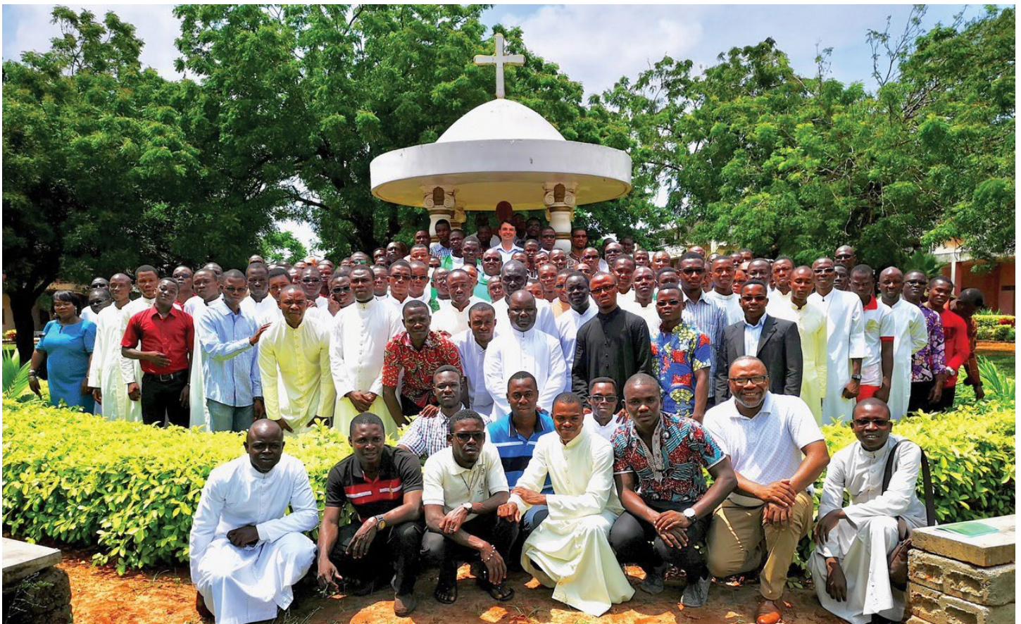
Participants in the HLI Francophone Africa Seminarians Summer Institute.

The main theme for this SSI was the 50 th anniversary of Blessed Paul VI's encyclical letter Humanae Vitae , and the future of Life and Family in Africa. HLI was greatly blessed to have several lecturers