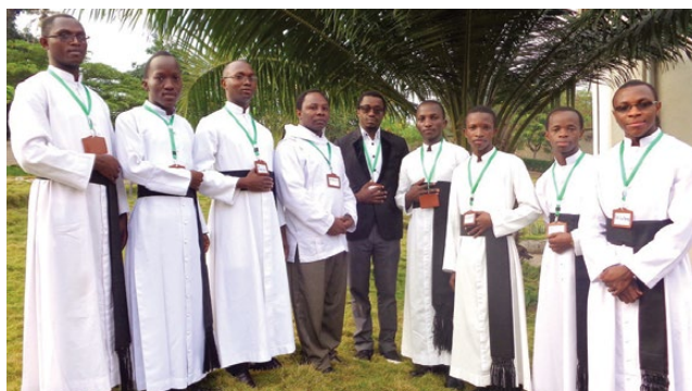
Some of the seminarians who attended the Humanae Vitae conference in Dar es Salaam in July 2018.

A PUBLICATION OF HUMAN LIFE INTERNATIONAL