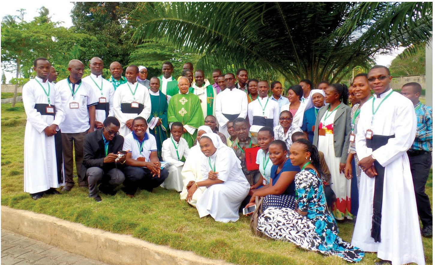
Some of the participants of HLI's "50 Years of Humanae Vitae " Conference held at the Amani Retreat Center of the Benedictine Sisters of Camaldolese.

After examining these statistics, I realized that, as contraception