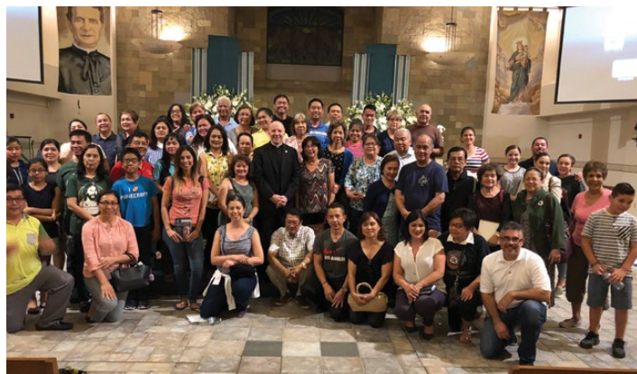
Participants of the Couples for Christ Foundation for Family and Life Conference.