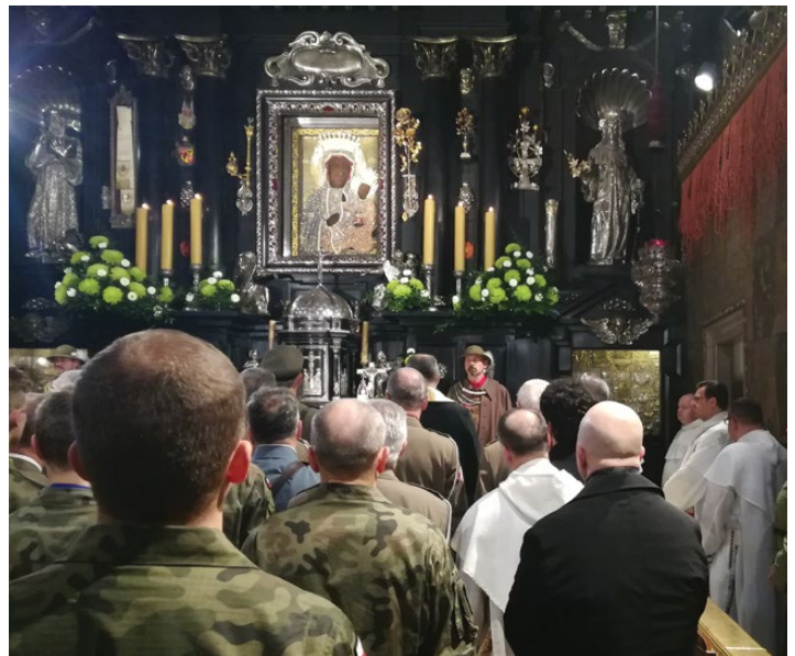
HLI participates in the 100 th anniversary celebration of Poland’s independence in the chapel of Our Lady of Czestochowa.