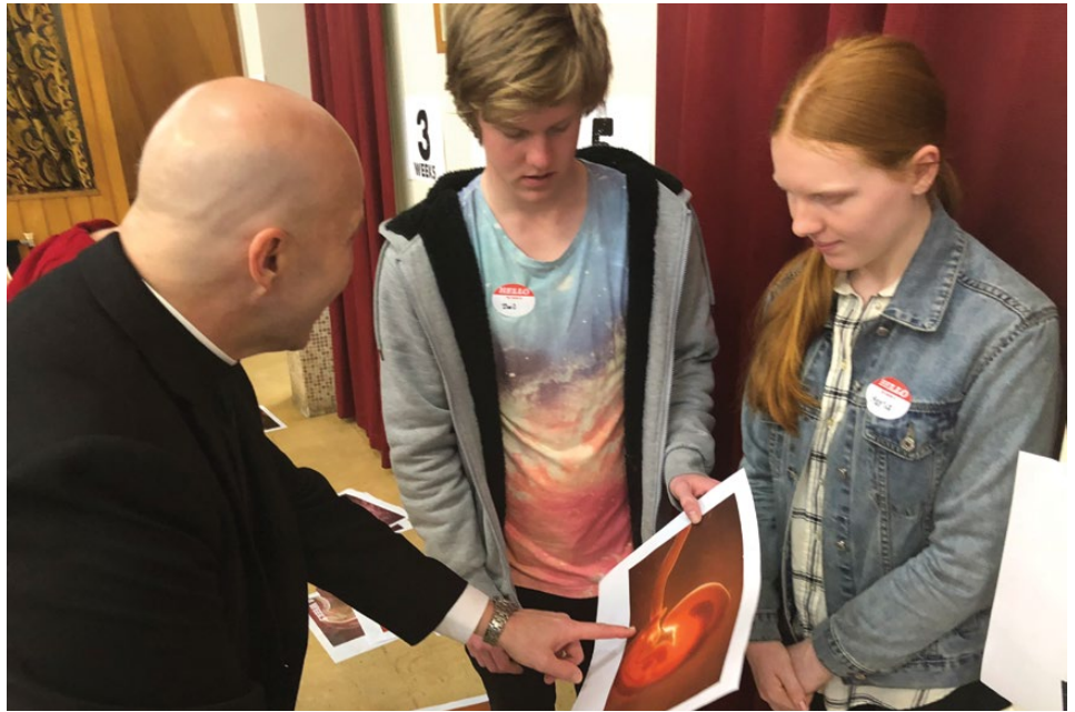
Two young people look at a photo of an unborn child at six weeks of development.

The most energetic day was the LifeFest Catholic Youth Conference for young people ages 13 to 20. We focused mainly on life before birth and on protecting the preborn. The