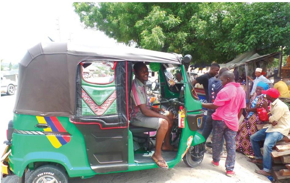
This Marie Stopes rickshaw is used in Africa to deliver contraceptives.