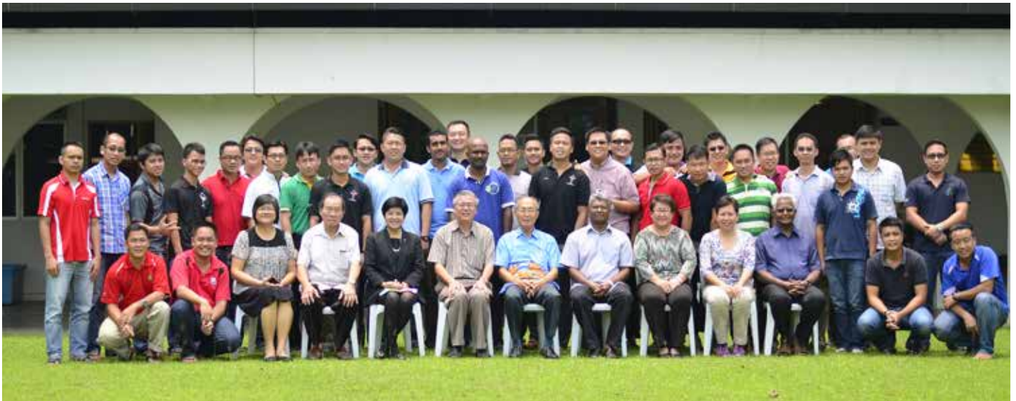
St. Peter's College Major Seminary, Kuching, Malaysia.

receive the HLI Pro-Life DVD Library and The Pro-Life Pastoral Handbook , as well as other HLI materials and publications.