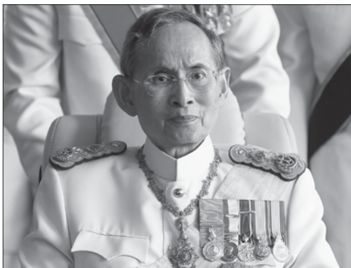
King Bhumibol Adulyadej 1927 - 2016

It was a different Thailand I saw when I arrived at the capital city of Bangkok in the afternoon of October 24. The first time I was here, the entire country was in festive mood with gold – the color identified with the King and the imperial household dominating the city. It was then blooming with royal decorations, celebrating the birthday of the country's well-loved monarch, King Bhumibol Adulyadej. This time, the dominant color was black! Even the huge billboards dominating the country's thoroughfares were predominantly black. The country was in deep mourning with the death of the King who reigned for more than 70 years, earning the distinction not only as the longest reigning monarch in Thai history, but also as the world's longest serving head of State. The somber mood of the entire