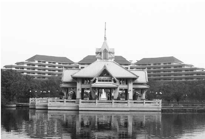
The 2017 ASPAC will be held at Baan Phu Waan, the Archdiocese of Bangkok's Pastoral Training Center.

As usual the 21 st ASPAC promises three full days of intellectual, social, and spiritual nourishment in the company of like-minded people from all over the world, with distinguished international and local speakers. Formerly held yearly, the ASPAC is now held every two years. (The 19 th ASPAC was held in Kota