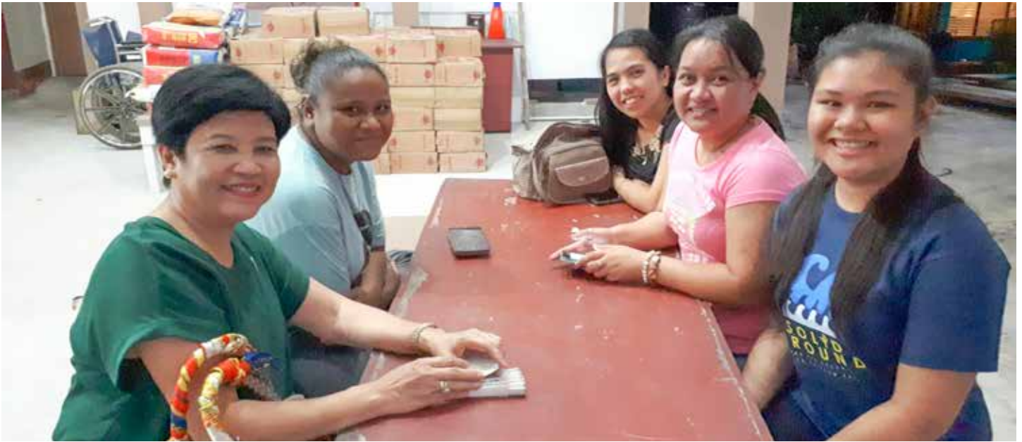
Youth Leaders in Palau enthusiastically received the news of HLI’s mission work, resolving to embrace it personally and spread it far and wide in their country.

heading the El Shaddai Catholic Charismatic group. I’ve had associations with the group in the Philippines, where it was founded and is primarily based. Right then they invited me to speak on HLI at their next Sunday gathering after Mass. HLI’s coming was God-sent, they said, as they had actually been praying for a speaker, hard to manage because of the cost.