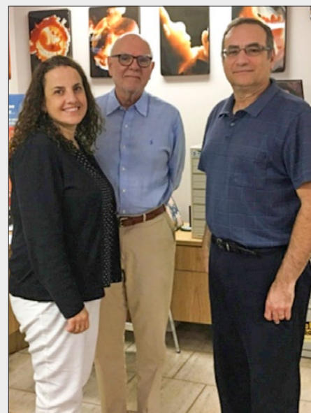
Our HLI Miami staff.

If you prefer to donate online, please visit www.hli.org and click the donate button on the top right.