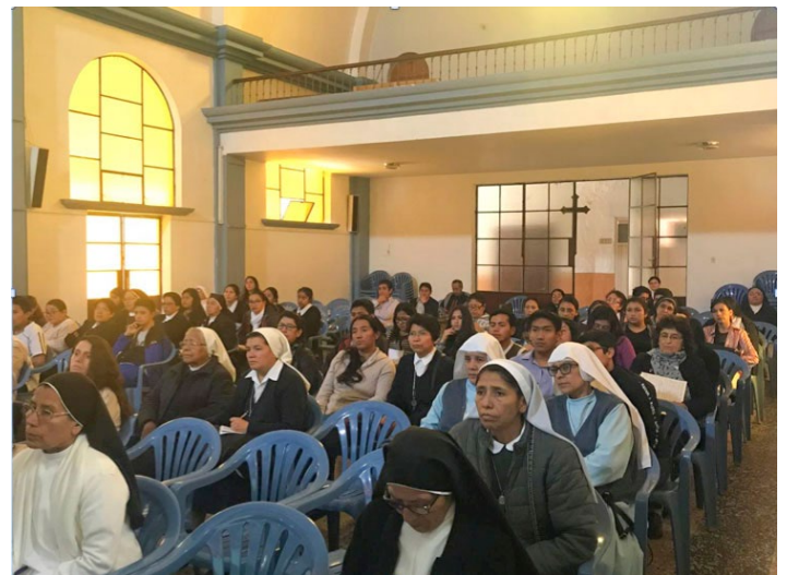
(Above) Over 100 religious listened to HLI lectures on Life and Family issues at the “Baths of the Inca” church.