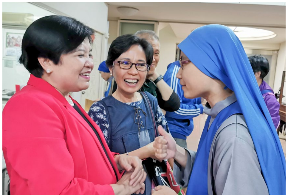
An SSVM sister expresses her enthusiastic approval after a talk given at Holy Martyrs of China Parish Church in Taichung City.

The talk attracted around 70 participants, which included lay leaders, Catholic faithful, priests, seminarians, and SSVM sisters. For Taiwan, it was an unusually large number of participants. Everyone stayed after the talk to share their touching impressions and pro-life resolve, which proved once more the power of the Gospel of Life. They shared their strong realization of the gravity of abortion and contraception, both for their personal and spiritual lives, as well as concern over the demographic facts of their country. They also expressed the desire to know more about pro-life issues and hear other HLI talks, particularly on marriage and the family.