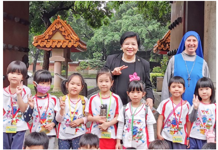
With Taiwanese School Children in Taichung City.

I returned to Taiwan from May 4-12, 2019, primarily to attend the country's first March for Life, and also to spread HLI's pro-life mission. I was again helped by HLI's mission partner, the St. Gianna Beretta Molla Pro-Life