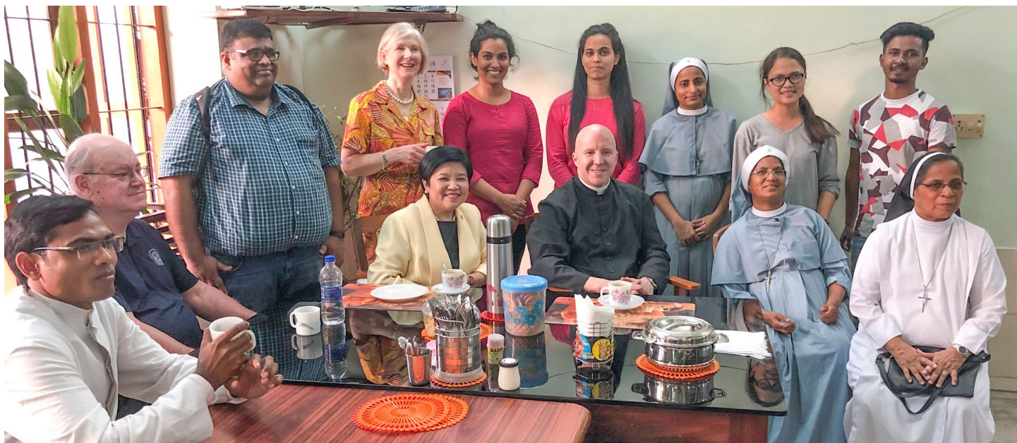
Pictured are some members of the organizing committee and participants who welcomed us to Kerala, India.