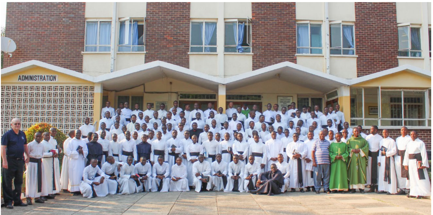
HLI offers three days of pro-life training to 140 major seminarians and professors at St. Dominic's Major Seminary in Lusaka, Zambia.