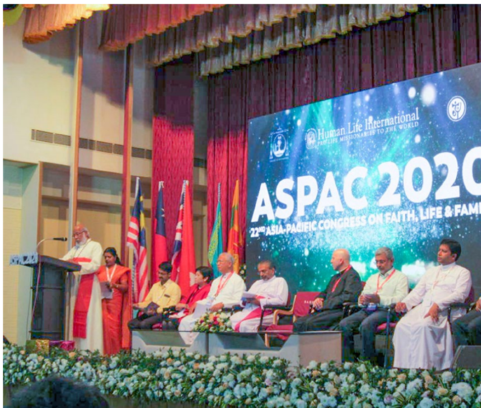
His Eminence George Cardinal Alencherry gives an address at HLI's 22nd Asia Pacific Congress on Faith, Life, and Family (ASPAC), held in Kerala, India. See next month's edition of Mission Report for the full story.

educating, and affirming each participant with a deeper knowledge of the issues affecting life and family, while also strengthening them to continue to fight the good fight – to give their all to the service of the Gospel of Life. Even during tea and coffee breaks, our team was bombarded with questions. There was such hunger and desire for the truth. Your faithful commitment helped provide the opportunity for these questions to be answered and encouragement to be offered.