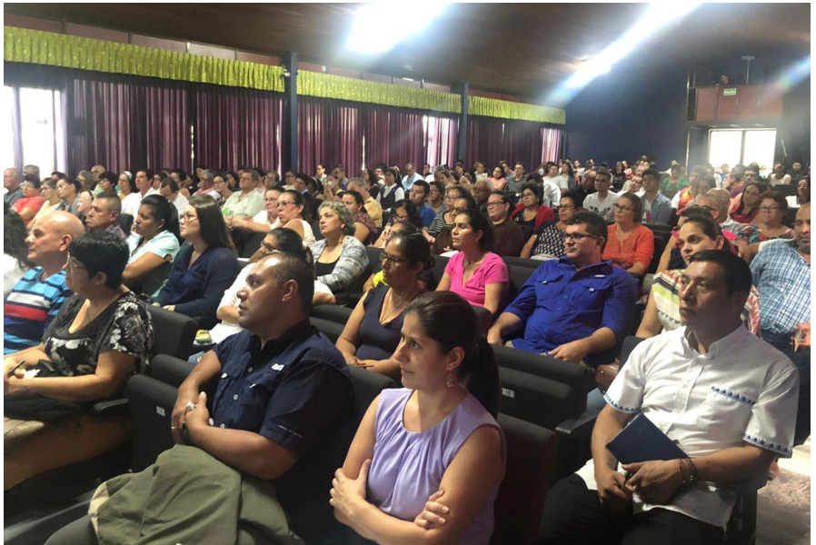
Around 250 attendees at the diocesan conference in Santa Clara, Costa Rica.

I spoke on the great battle of our time, the Culture of Life verses the Culture of Death, using Pope St. John Paul II's