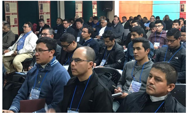
100 priests and seminarians attended the REDESSVIDA Congress.

As an HLI team, we declared that the 2019 REDESSVIDA Congresses were successful! The information presented was comprehensive and well balanced, demonstrating that the findings of scientific research (medical and psychological studies, and statistical data)