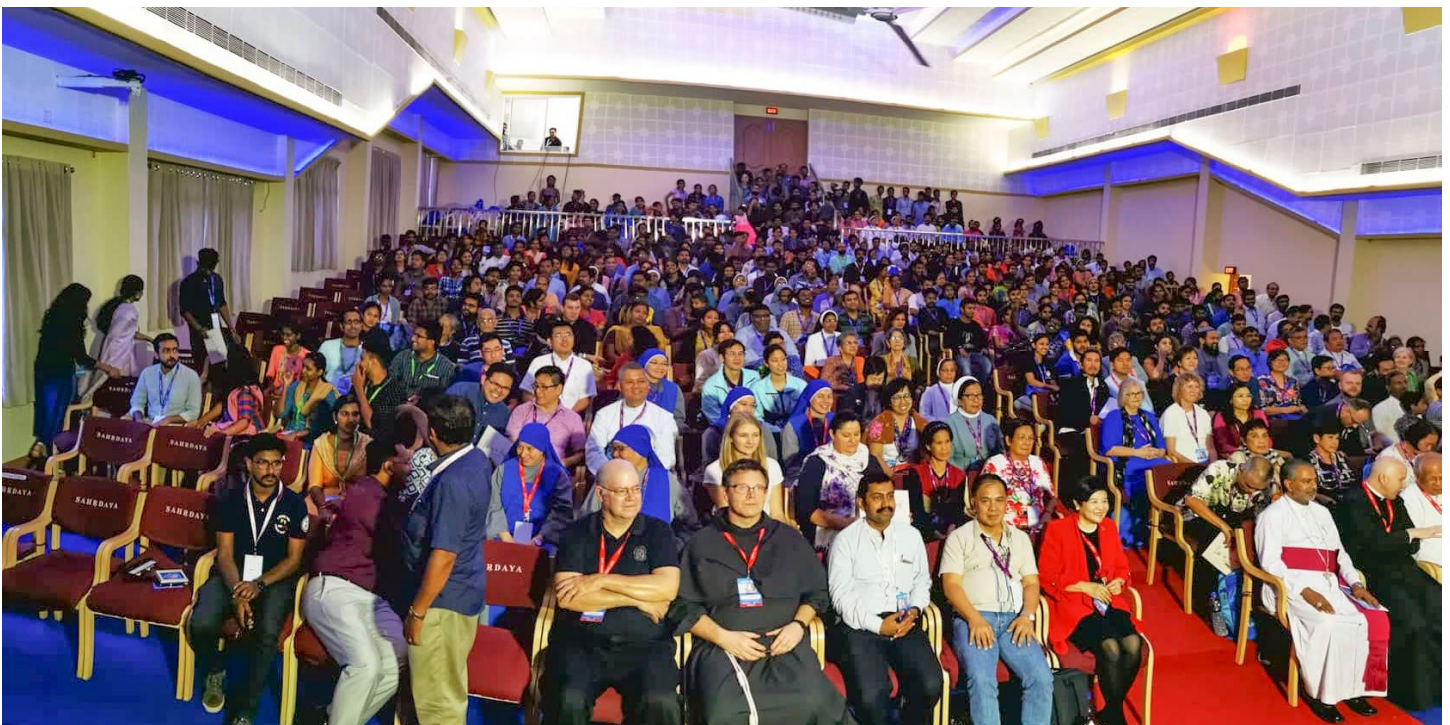
Participants of HLI's 22nd ASPAC.

The lighting of the inaugural lamp is an Indian tradition usually performed by dignitaries. For the 22nd Asia-Pacific Congress, we chose three pro-life couples to light the lamp with their children, who became little dignitaries. We chose parents who live their faith and pro-life convictions by welcoming all the children that God gives them. One was a wife and mother of eight who, despite painful difficulties giving birth and complications from previous Caesarean-sections, she and husband remain open to life, welcoming each child as a loving gift of God. Another was a husband and wife who were pressured by physicians to abort their child with disabilities. The couple brought