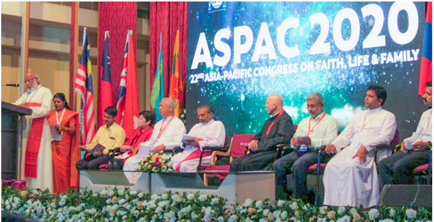
His Eminence George Cardinal Alencherry giving his message during the Valedictory Ceremony.

I am grateful to the Lord for the people making a stand